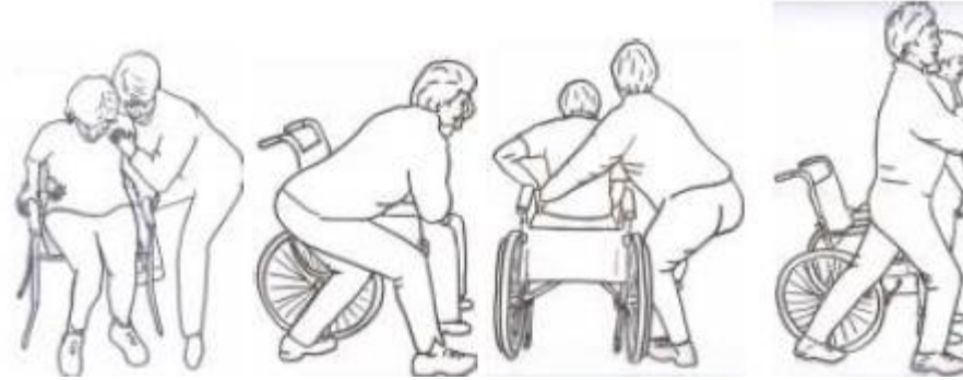
The Drag Lift from chair