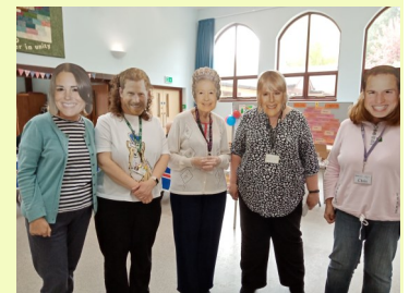
Frodsham Club members were served by the 'royal family'