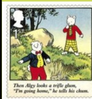
Then Algy looks a trifle glum. "I'm going home," he tells his chum.

We may not have a regular cartoon in Reach, but we were still astounded to read that Rupert the Bear appeared in the Daily Express 100 years ago – on 8th November 1920. To celebrate, Rupert has been honoured by the Royal Mail in a set of eight stamps.