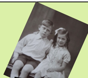
'Record breaking' Twins

Always tell the truth because if you tell a lie you usually have to tell another to cover it up.